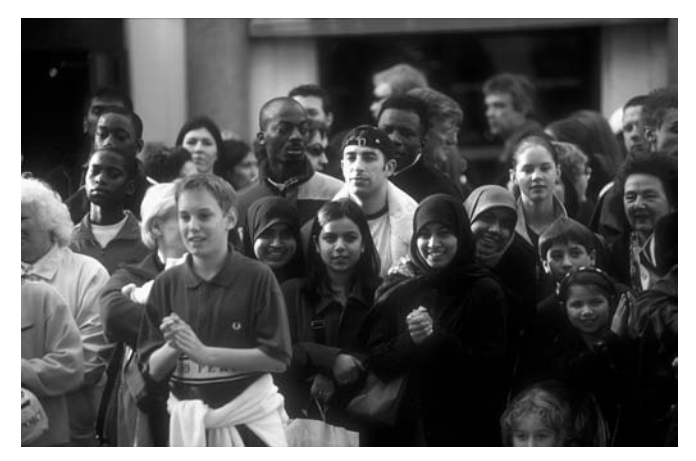
13. Ethnic diversity in Leicester Square, London, UK

This effect has become even more intense as the diversity of immigration populations themselves has increased. The UK provides a good example. For well over a century the Irish have migrated to the UK in significant numbers, and they still are the largest foreign national group living there (in 2003 there were about 375,000 Irish in the UK). After the 1950s there was significant immigration from former British colonies like India, Pakistan, Jamaica, and other Caribbean Islands. Since 1970 immigration from Australia, Canada, New Zealand, and South Africa has been actively encouraged. In recent years this already diverse society has been further diversified by the arrival of peoples from still more countries. Since the 1990s, for example, there have been significant arrivals in the UK from Afghanistan, China, Iraq, Kosovo, and Somalia. Some people have described the situation in the UK today as 'hyper-diversity'.