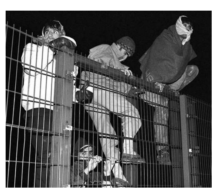
7. Migrants climbing over a fence in Frethun in Northern France to board a freight train bound for the Channel Tunnel and the UK

It is clear, then, that irregular migration can threaten state security, although the relationship is complex. Equally, however, irregular migration can undermine the human security of the migrants themselves. The negative consequences of irregular migration for migrants are often underestimated. It can endanger their lives. A large number of people die each year trying to cross land and sea borders without being detected by the authorities. It has been estimated, for example, that as many as 2,000 migrants die each year trying to cross the Mediterranean from Africa to Europe, and that about 400 Mexicans die trying to cross the border into the USA each year. And one of the great unknowns of international