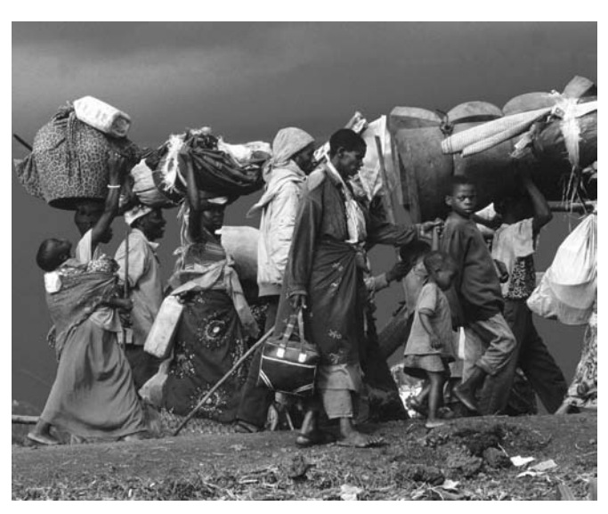
8. Rwandan refugees on the move

Although this is not the place to review the extensive literature on modern warfare, it is worth listing the characteristics that the