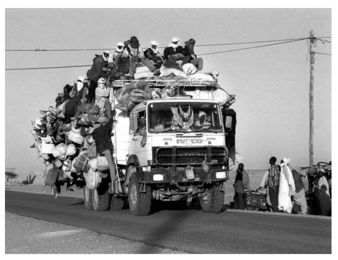
2. A truck loaded with migrants leaving Agadez in Niger and bound for North Africa

Furthermore, the traditional pattern of migrating once then returning home seems to be phasing out. An increasing number of