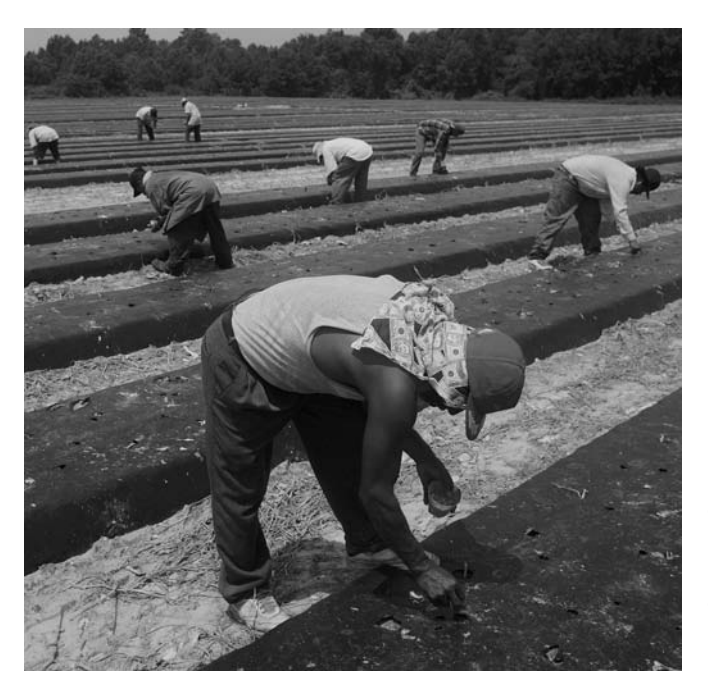
3. Undocumented migrant farm workers in North Carolina, USA

last night was pleasingly cheap, it may well be because the people working in the kitchen have irregular status and are therefore earning less than the minimum wage. The advantage for employers is that irregular migrants are flexible and cheap. The migrants themselves, however, are often exploited and abused.