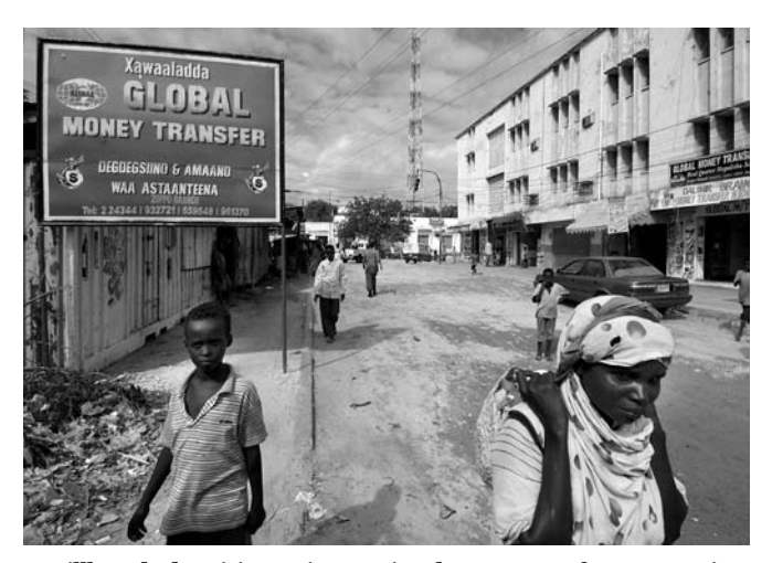
5. Billboard advertising an international money transfer company in Mogadishu, Somalia

These data problems notwithstanding, the World Bank produces annual estimates of the scale of remittances worldwide. They estimate that in 2004 some US$150 billion was sent home by migrants, and forecasts indicate that the figure was closer to US$200 billion in 2005. These are quite staggering sums. They are also striking because they represent a 50 per cent increase in the flow of remittances in just five years – the main reason being the impact of globalization. According to some analysts, in terms of