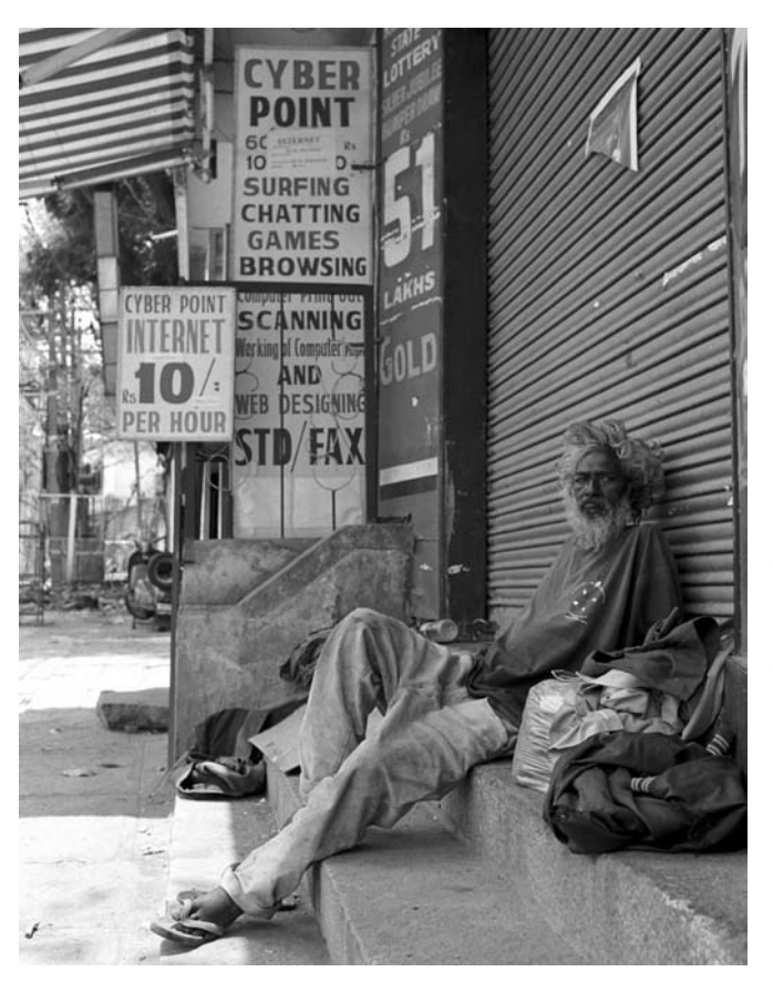
4. Homeless man sitting next to an internet café in Bangalore, India

made or received a phone call', although this statistic has been widely debated ever since. Bridging the digital divide is nevertheless considered important for achieving global equality, increasing social mobility, encouraging democracy, and promoting economic growth.