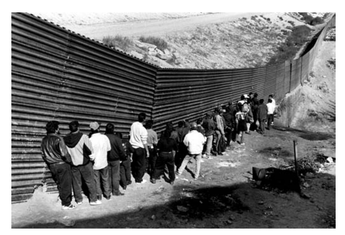
6. Migrants at the US border fence in Tijuana, Mexico

The two other terms that are often used in this context are 'undocumented' and 'unauthorized'. The former is avoided here because of its ambiguity. It is sometimes used to denote migrants who have not been documented (or recorded), and sometimes to describe migrants without documents (passports or work permits, for example). In addition, neither situation necessarily applies to all irregular migrants – many are known to the authorities and many do have documents – yet the term 'undocumented' is still often used to cover them all. Similarly, not all irregular migrants are necessarily unauthorized, and so this term too is often used imprecisely. Irregular migration is an awkward term, but I consider it the best of the commonly used alternatives.