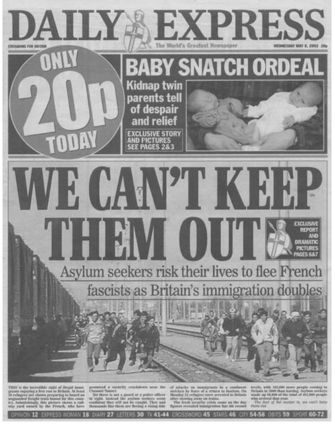
10. An alarmist Daily Express front page from 2002

Asylum-seekers have risen to the top of political agendas across the industrialized world, in particular in Europe, and there is a perception in certain parts of the media and sometimes among the public of an impending crisis. On the one hand, it is possible to argue that this crisis has been exaggerated. On the other hand,