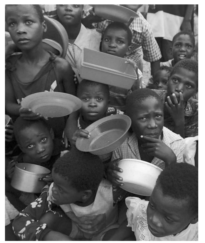
9. Mozambican refugee children queuing for food

– in other words for refugees to return home. An initial comment is to place the emphasis on the term 'voluntary'. Although as we have seen non refoulement is a central tenet in refugee protection, there are cases where refugees are returned against their will and before it is safe for them to go home. Another potential dilemma for repatriation is how to define home. Is it, for example, appropriate to return refugees to a place in their country of origin that is safe, even if their specific region of origin is still