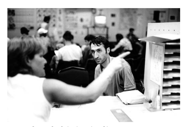
11. An asylum-seeker being interviewed in Dover, UK

streamlined to try to process applications more quickly. Access to welfare benefits for asylum-seekers was restricted.