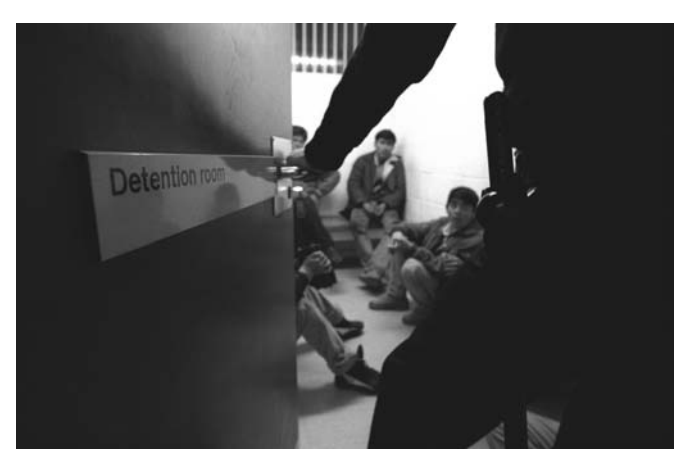
12. Asylum-seekers who arrived in the UK aboard a freight train being detained in a holding cell in Folkestone

The situation of rejected asylum-seekers remaining in the destination country despite having had their applications and