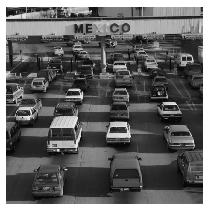
1. The US-Mexico border is the most frequently crossed international border in the world – about 350 million people cross it each year

migrations in early history include that of the Vikings and of the Crusaders to the Holy Land.